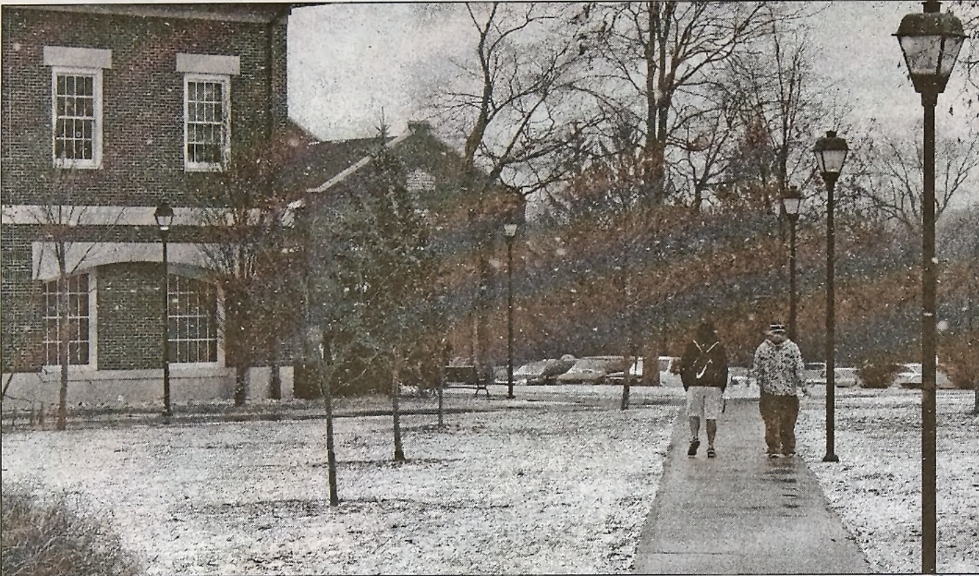
Students walk back to the dorms in the first snow of the semester.